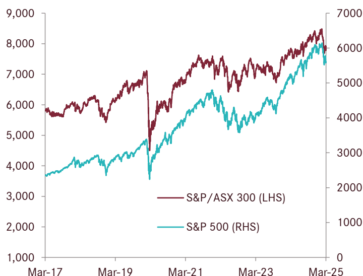
S&amp;P/ASX 300 (Aus.) and S&amp;P 500 (US) Equity Indices