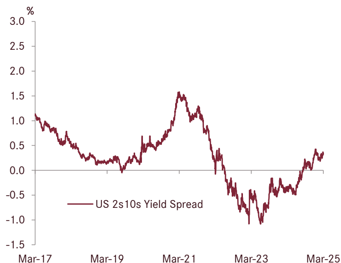
US Yield Spread

China is clearly in President Trump's sights when it comes to the trade war and setting of tariffs. Following the initial 20% tariff set in February by President Trump, the Liberation Day tariff of an additional 34% was set by the US. China immediately matched these tariffs on US imports. President Trump has subsequently announced that if China matches the 34% tariff, as they have stated, President Trump will apply an additional 50% tariff on China, bringing the total tariffs applied against Chinese imports to 104%. In terms of Chinese economic data, headline CPI fell by -0.1% (deflation) in the year to end March, while NBS Manufacturing PMI rose to 50.5 in March, and NBS Non-Manufacturing PMI increased to 50.8 in March. Weakening economic conditions are expected in China over coming months, however, authorities are likely to initiate further considerable stimulus packages to try and offset the hits coming from the tariff war.